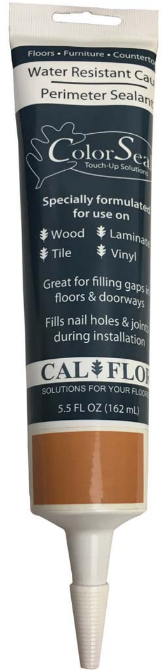
5.5 oz Tube